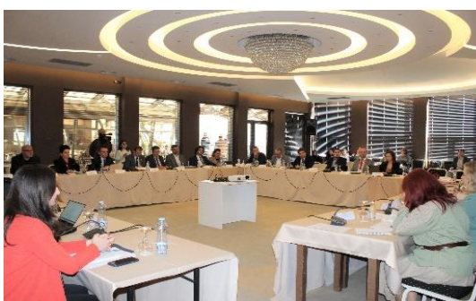
KAA Law Public Hearing event

This event targeted higher education institutions' representatives and academia to enable a forum of discussion about the last version of the law. Participants commented and discussed