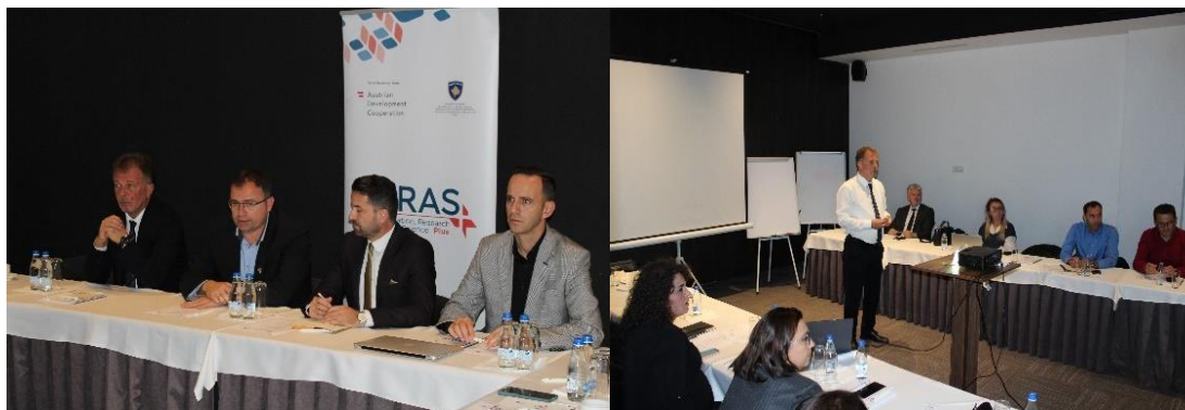
“Training of Trainers” Workshop with University of Prizren for the Didactic Center for Excellence in Teaching (CET), 6 October 2022.

The event addressed modern teaching methodologies which may be subject of future training modules to be developed and delivered by CET (Annex 19: The training modules for CET UUHP). The event was attended by CET affiliated academic staff of UUHP, being in the process of becoming CET trainers. The workshop was followed by a 2-days training of trainers (ToT), which took place on 21-22 October 2022.