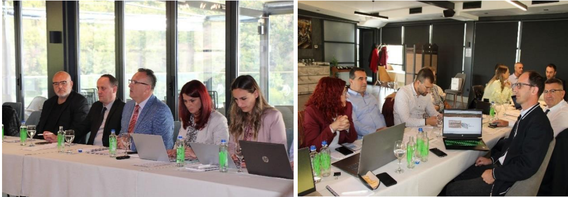
Workshop with University of Peja on Developing the University Strategic Plan, 6-7 October, 2022.

The project also supported the development of a new strategic document necessary for institutional accreditation. For this purpose, the project engaged a local expert and organized a two-day workshop that was attended by senior management, steering board members, deans, academic staff, representatives of the private sector, civil society and media.