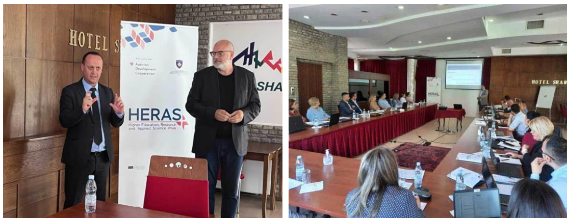
HERAS Plus supports an extended training on advanced teaching methods for University of Peja, 30 May – 3 June, 2022.

During the reporting period, the project supported a five-days Training of Trainers (ToT) on the “Advancement of teaching methods in higher education” for academic staff of the UHZ. This event was co-organized and co-funded with the CERGE-EI Foundation project 8 . The central aim of this activity was to develop and deliver a series of pedagogical tools based on CERGE-EI’s popular and tested Teaching Principles and Practices course.