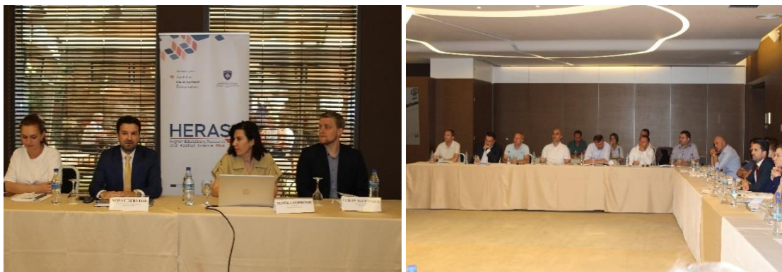
Training: "Successfully implementing and applying for Erasmus+ International Mobilities in Higher Education, 28 June 2022.

Same as above, the second training also aimed at providing theoretical and practical knowledge on the Erasmus+ mobility funding scheme, with a specific focus on mobility projects for academics, students and university staff in Kosovo (particularly Key Action 107/171), covering the program's basic structure, its budget, implementation and application process.