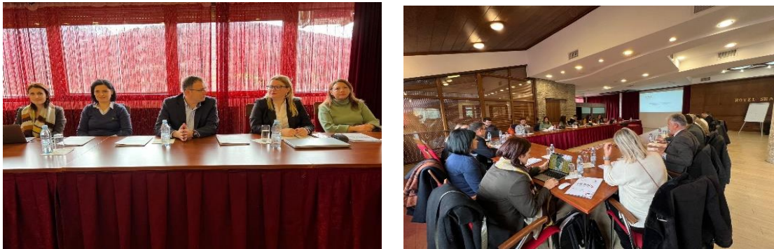
Workshop with University of Prizren on Support in the Process of Preparing for Institutional Accreditation, 25-26 November 2022.

On 25-26 November 2022, a workshop was organized with support of the project to further assist UUHP in the process of preparing for institutional accreditation.