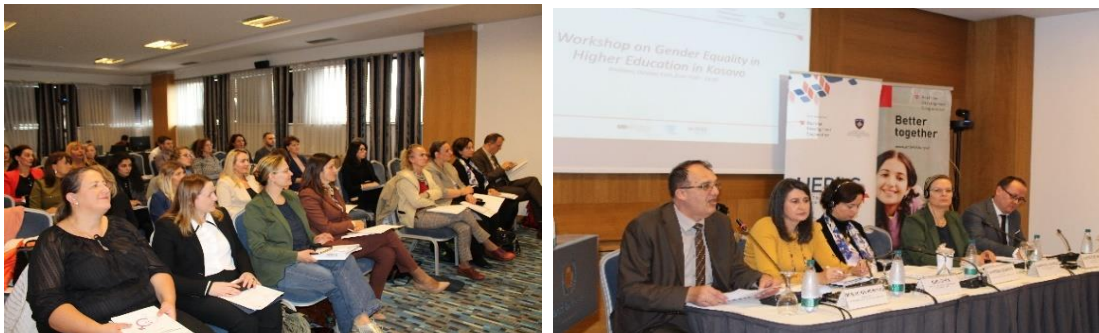
Workshop on Gender Equality in Higher Education in Kosovo, 11 October 2022.

Equality in Higher Education Institutions in Kosovo). As previously reported, the project closely followed the development of the 1 st HRBA instrument and findings from the 1 st HRBA workshop in 2021, where key stakeholders recommended to develop a 2 nd HRBA instrument that explicitly targets gender equality in higher education. This was followed by the development of a comprehensive analysis, including a set of focus groups and interviews. On 11 October 2022, the project organized the 2 nd HRBA workshop where the analysis developed by a national expert and the project was launched and presented in front of 40 representatives from universities, public institutions and Civil Society Organizations (CSOs).