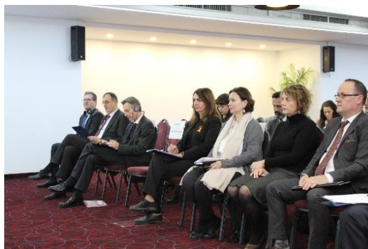
Launching of the Roadmap for the Performance based-funding of public HEIs, 25 November 2022.

In close cooperation with MESTI, the project also organized a two-day workshop (28-29 July 2022) for the draft of a concept document for the revision of the Law on Scientific Research Activities. The event assembled the members of the working group. (Annex 7: MESTI Decision on establishing WG on drafting the concept document for the revision of Law on Scientific Research Activities). As a result, a concept document for further proceedings at MESTI was drafted.