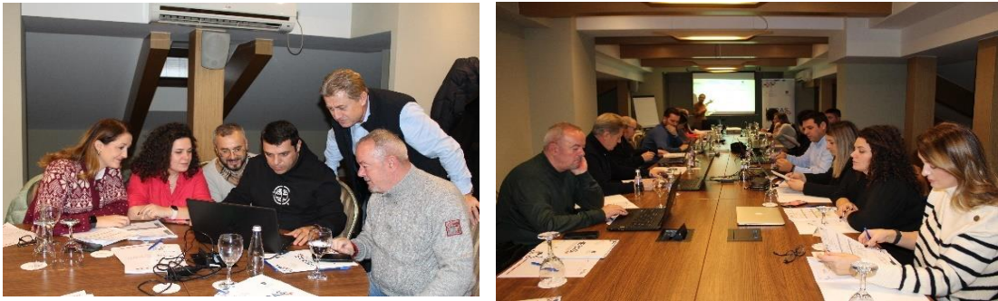
Project Cycle Management Training with University of Gjilan, 29 – 30 November 2022.

The project also organized and facilitated a two-day tailor-made workshop on Project Cycle Management (PCM) which was attended by a core team of academic and administrative staff of UKZ, who were determined to work on further advancing the university's performance in applying and implementing projects.