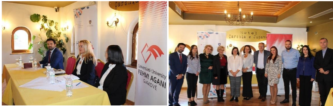
Learning Outcomes workshop with University of Gjakova, 23 September 2022.