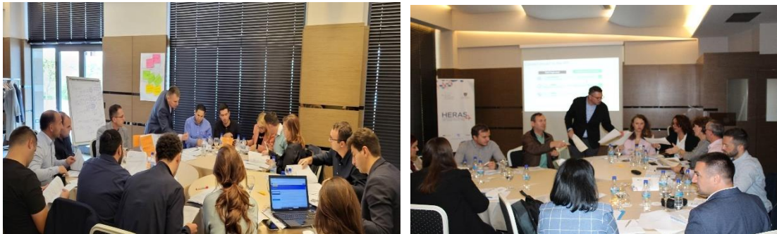
Workshop on Horizon Europe Project Proposal Writing, 22 September 2022.

During the reporting period, the project prepared and delivered a workshop on Horizon Europe Project Proposal Writing. It further supported capacity building of the Kosovo National Contact Points (NCP) structure and provided training of young professionals on Horizon Europe.