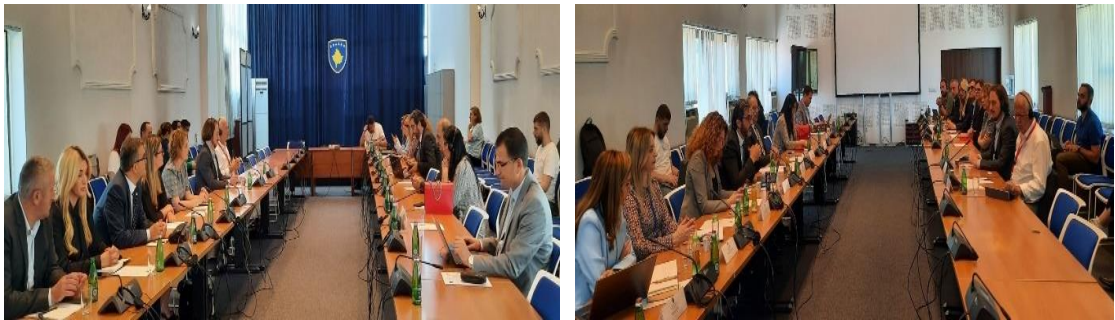
Official meeting of the EQAR representatives with AoK members, 16 June 2022.

As a follow up to the finalization of the KAA law, the project facilitated an official visit of officials from the European Quality Assurance Registry (EQAR) to Kosovo on 16 June 2022, where EQAR representatives met with the representatives of MESTI, KAA and members of the Committee on Education, Science, Technology, Innovation, Culture Youth and Sport of AoK.