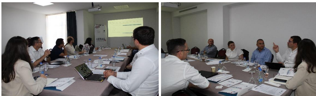
The 7th Working Group Meeting about the Kosovo Research Information System (KRIS), 6 September 2022.

Once developed and in force, the CRIS will act as a national research information system for systematically gathering data on research indicators in Kosovo and its diaspora community, enabling data generation for specific interest groups and users (Annex 10: Presentation of CRIS). As a management information system, CRIS will serve as a national repository for information regarding researchers, institutions, national and international funded projects, licensed research institutions, research infrastructure, journals, and activities. In order to make CRIS self-sustainable, the project supported MESTI to integrate it within the structures of the Kosovo information society agency that will host the platform (Annex 11: Conceptual Plan of CRIS submitted to AIS). The next steps are piloting the final CRIS in January 2023 followed by a new AI that will outline the main provisions of implementation of CRIS (More information will follow in the next progress report).