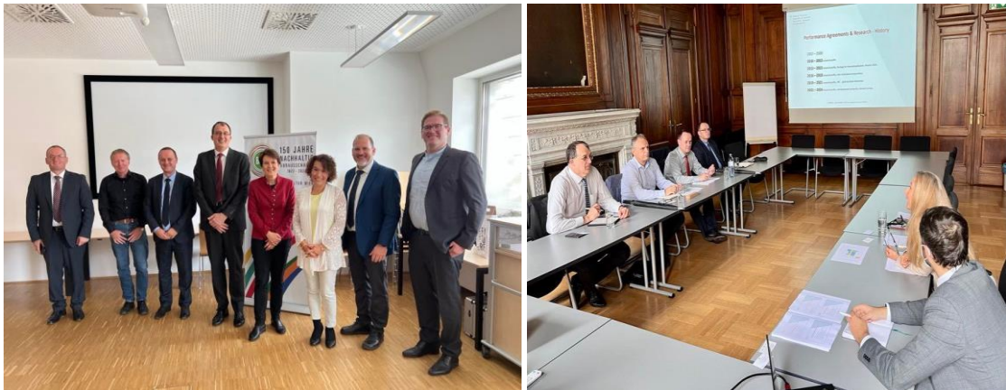
Official visit in Austria, 12-15 September 2022.

As a follow-up to the working group proceedings and aimed at the finalization of the roadmap, the project organized and facilitated a study visit to Austria for a Kosovan delegation, composed of representatives of MESTI and of public HEIs (12-15 September 2022).