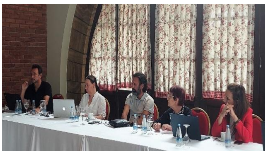
The 3rd Working Group meeting for the Revision of Law No. 04L-135 on Scientific Research Activities, 28-29 July, 2022.