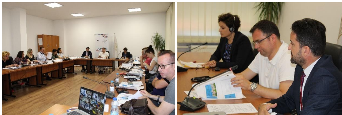
Workshop with University of Prizren on "The Concept of the Third Mission of Universities", 16 June 2022.

On June 2022, the project facilitated a tailor-made event related to the third mission of universities, considering experiences and perspectives from Austria.