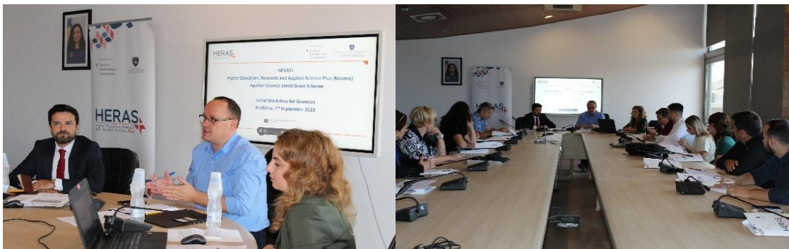
Applied Science Grant Scheme Internal Workshop, 7 September 2022.

During the reporting period, the project prepared, negotiated and signed contracts with all AS grantees and a joint workshop for all grantees was organized to discuss implementation modalities, challenges that they might face, reporting templates (both, narrative and financial) and other matters which are essential for a smooth and efficient implementation. In addition, all grantees presented their respective projects during the workshop and discussed possible synergies, challenges and opportunities that may emerge during implementation.