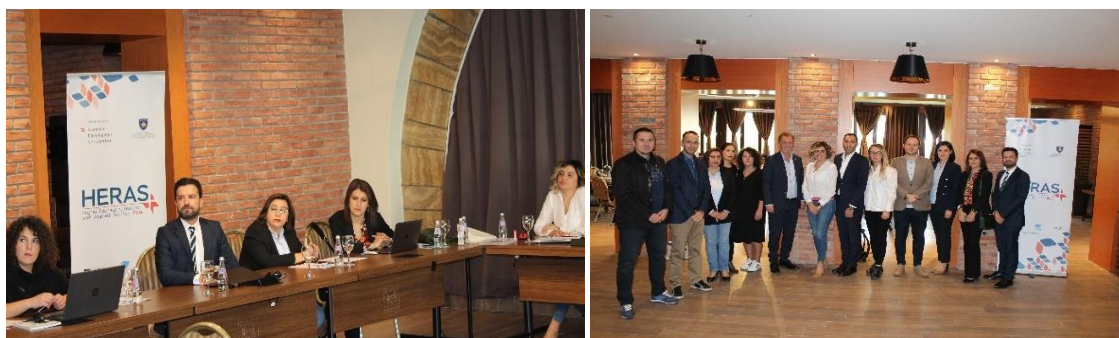
“Training of Trainers” Workshop with University of Prizren, Didactic Center for Excellence in Teaching, 21-22 October 2022.

The event addressed modern teaching methodologies which may be subject of future training modules to be developed and delivered by CET (Annex 19: The training modules for CET UUHP). The event was attended by CET affiliated academic staff of UUHP, being in the process of becoming CET trainers. The workshop was followed by a 2-days training of trainers (ToT), which took place on 21-22 October 2022.