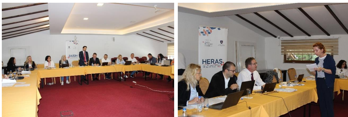
Project Cycle Management Training with University of Gjakova, 12-15 September 2022.

On September 2022, the project organized a three-day tailor-made training for academic staff of UFAGJ on Project Cycle Management (PCM) which is considered critical for further institutional development of the university in areas such as internationalization and the absorption of new funds from different donor funding organizations. The training was tailored to the specific needs of UFAGJ.