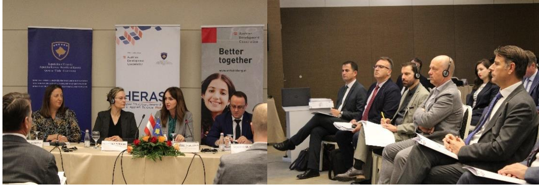
The Second Annual Higher Education Conference, 13 October 2022.

The main aim of the event was to convene all relevant stakeholders of the higher education sector in Kosovo to discuss different questions related to monitoring and evaluation of strategic documents of HEIs. In this regard, a Manual on how to conduct monitoring and evaluation was developed and launched during the event (Annex 15: Manual for monitoring and evaluation of strategic documents in public universities of Kosovo). To help universities respond to increased pressure to improve their M&E systems, the conference was an opportunity for delegates to come together to share their experiences and to acquire new knowledge. The conference proceedings were compiled in a policy brief document which was shared with all attendees of the Conference as well as with other relevant stakeholders (Annex 16: Policy Brief from the 2nd Annual Conference on Higher Education in Kosovo). The document also includes ideas and suggestions for the 3 rd annual conference which is envisaged for 2023.