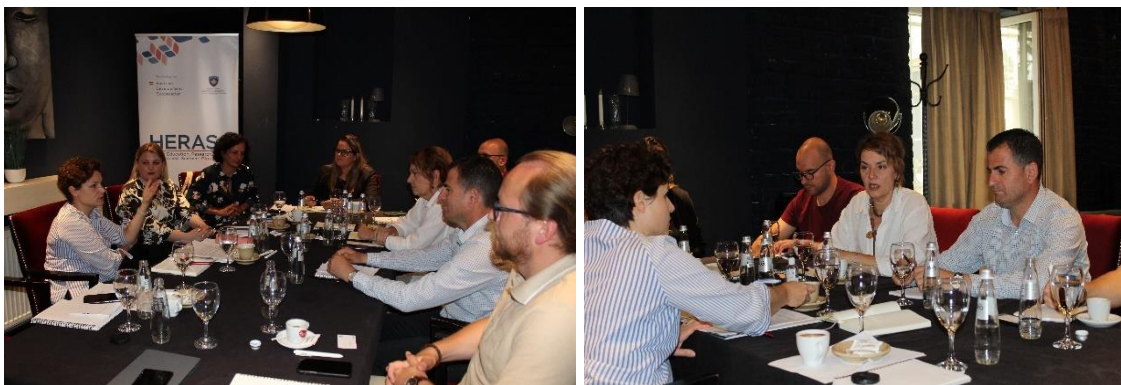
Joint meeting of Heras Plus international expert with Kosovo Accreditation Agency, 17 June 2022.

On 17 June 2022, the project supported a valuable exchange between a HERAS Plus international expert and the KAA staff and board members. Best practices and comparative perspectives were provided on different topics, including on the development and approval of policies (evaluation standards, etc.), decision-making procedures, stakeholder involvement, and the composition of the board and its responsibilities.