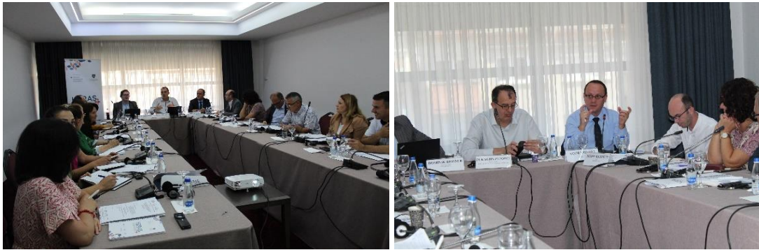
The second working group meeting on performance-based funding of public universities, 14 July 2022.

As a follow-up to the working group proceedings and aimed at the finalization of the roadmap, the project organized and facilitated a study visit to Austria for a Kosovan delegation, composed of representatives of MESTI and of public HEIs (12-15 September 2022).