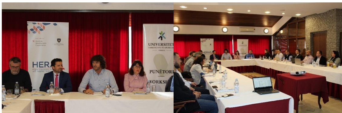
Workshop with UASF working group on Institutional Accreditation and review of Self Evaluation Report, 3-5 November 2022.