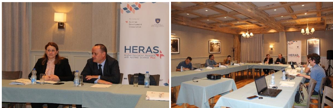
Launch of the Kosovo NCP platform, 24 August 2022.

On another note, the project supported the development of the Kosovo NCP Platform 18 , which was launched, presented and elaborated at an event supported by the project.