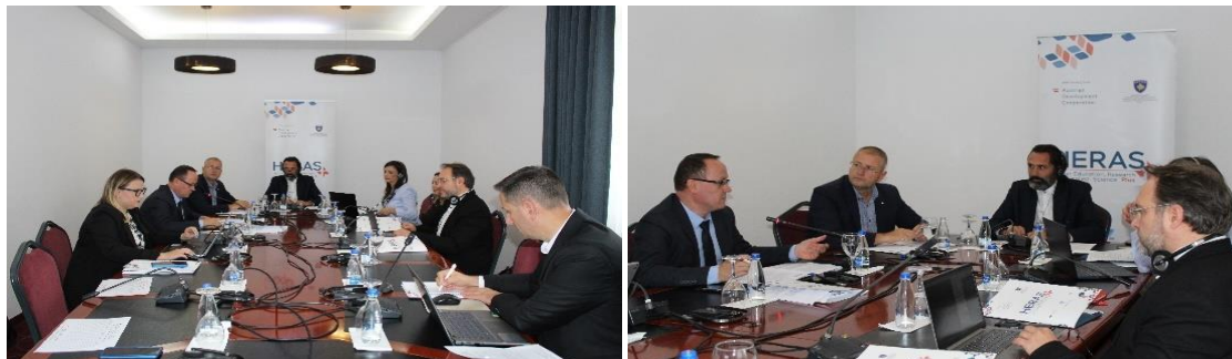
HERAS Plus supports the development of a new Administrative Instruction on the Register of Scientific Innovative Institutions, on 20th September 2022.

On 20 September 2022, the project together with MESTI, supported and provided feedback to the working group proceedings (Annex 8: MESTI Decision on establishing WG on drafting the AI on Register of the scientific innovative institutions) for developing a new Administrative Instruction (AI) on the “Register of Scientific Innovative Institutions”.