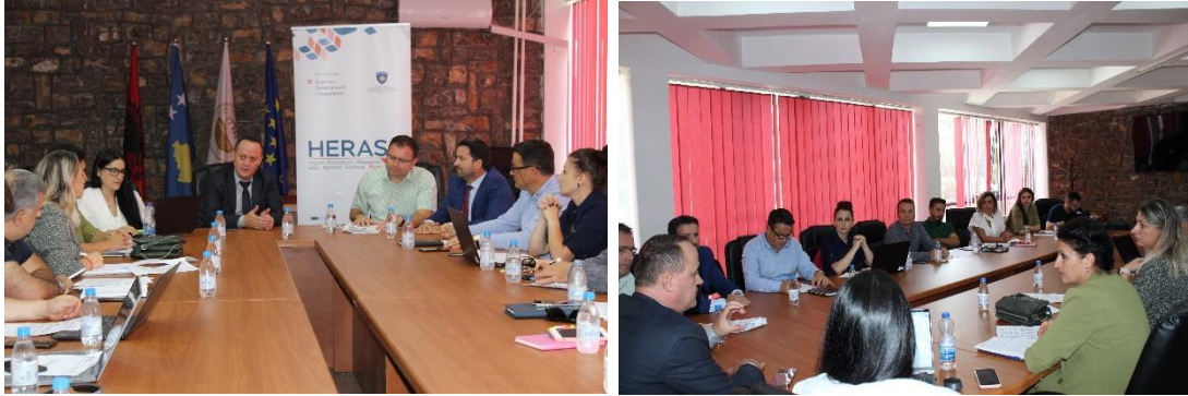
Meeting with University of Prizren on Presenting Analysis for Institutional Accreditation, 1 September 2022.

During the reporting period, the project also supported UUHP with preparations for their institutional accreditation. On 01 September 2022, the project organized an event with 20 academic staff to present the expert review of over 20 instruments (internal regulations, guidelines, questionnaires, and reporting templates) that are currently being used in the quality assurance (QA) process at the university. The workshop served as a platform to present the findings and discuss the recommendations.