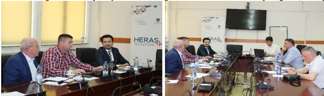
Kickoff meeting with University of Gjilan on Assessing the Market Relevance of Study Programs, 17 May

Same as above, the UKZ requested support to assess the labour market relevance of existing study programmes. The activity turned out to be very complex due to its active involvement of members of the Steering Board, senior management and academic units. Stakeholders at UKZ differed in their approaches related to the methodology and scope of the assessment. The project was proactively coordinating and facilitating this process and ultimately an agreement could be found. The activity could be finally kicked-off in a workshop and the follow-up was spearheaded by a national expert engaged by the project.